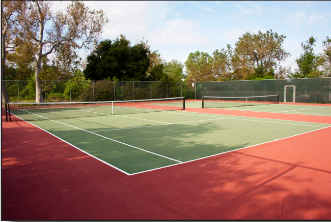
FGE Tennis Courts - before restoration - May 2012

Thankfully, due to the economy, we were able to get them renovated, including solving some drainage problems, again in 2012 for nearly the same price, just over $8,000 and they look great. Let the games begin!